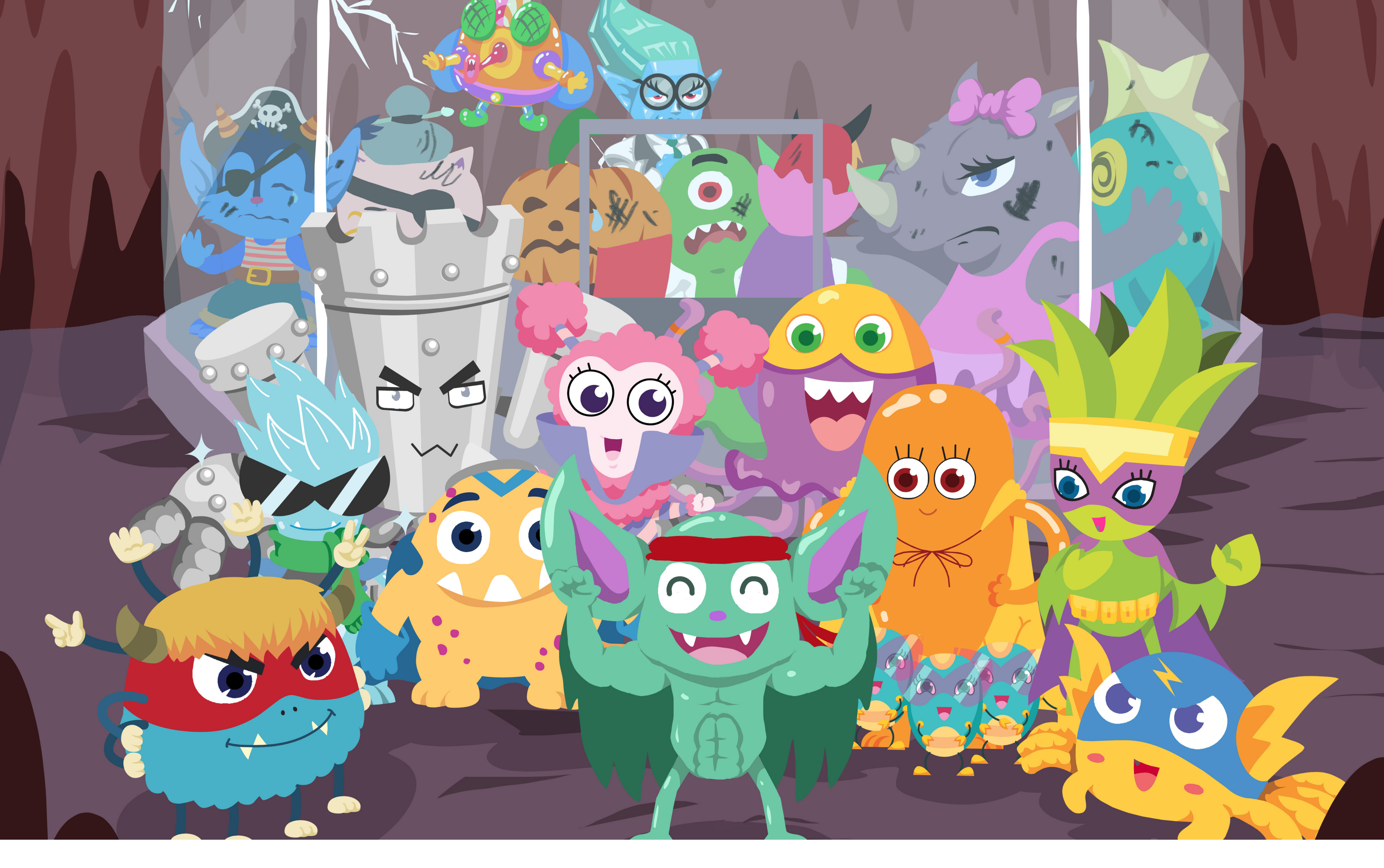
In no time at all, with The Fearless Fang fighting at their side, the MonsterHeroes had turned the tables on the villains and locked them away in their own prison. "Thank you for freeing me MonsterHeroes, I'm back to myself at last! These silly villains are going to be locked up for a long time!"