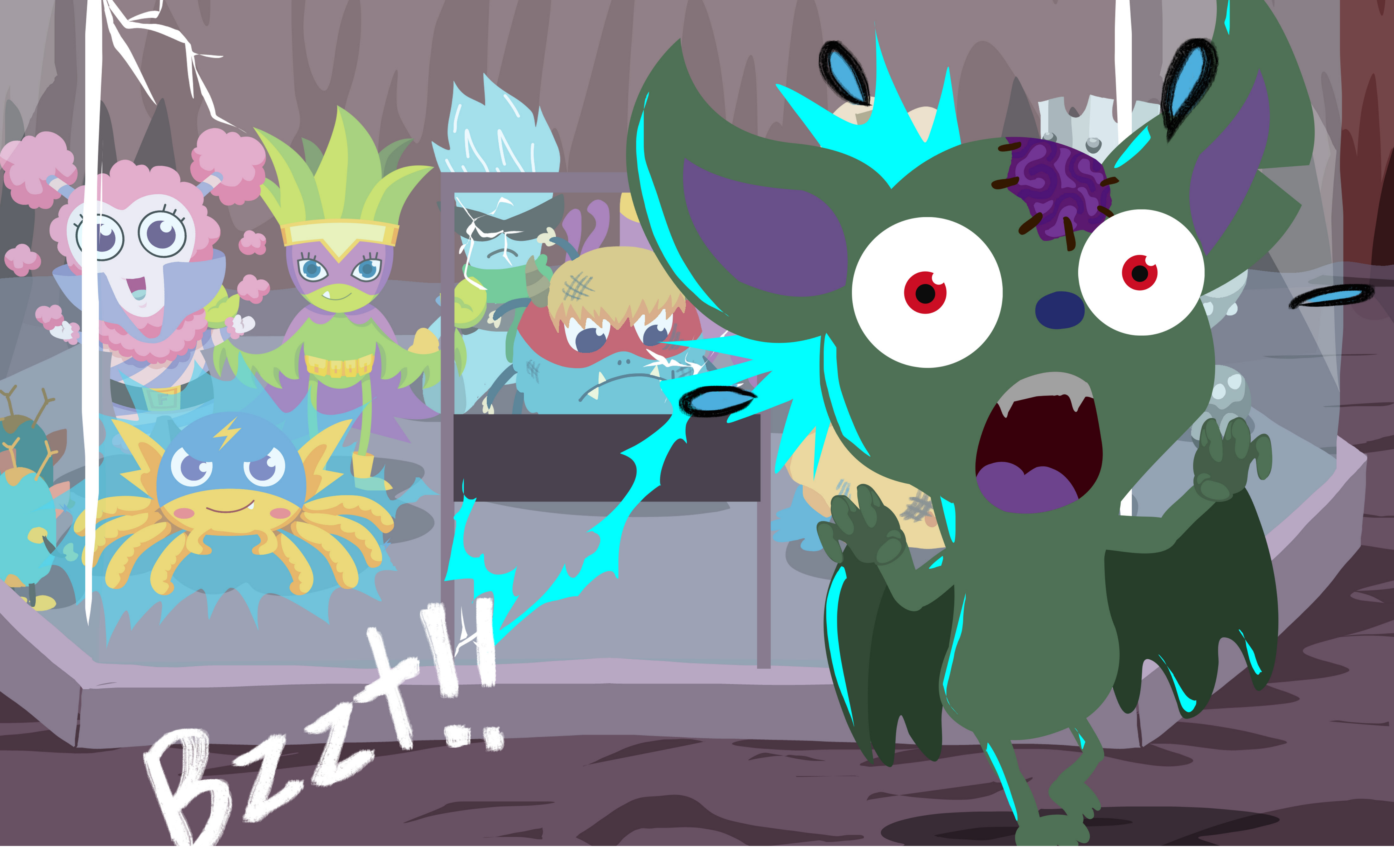
"I have an idea!" She said to Electropod. "If my calculations are correct, a short directed shock into that thing will disable it completely and free Zombat of their evil control." Electropod Smiled, "Ok here goes nothing..."