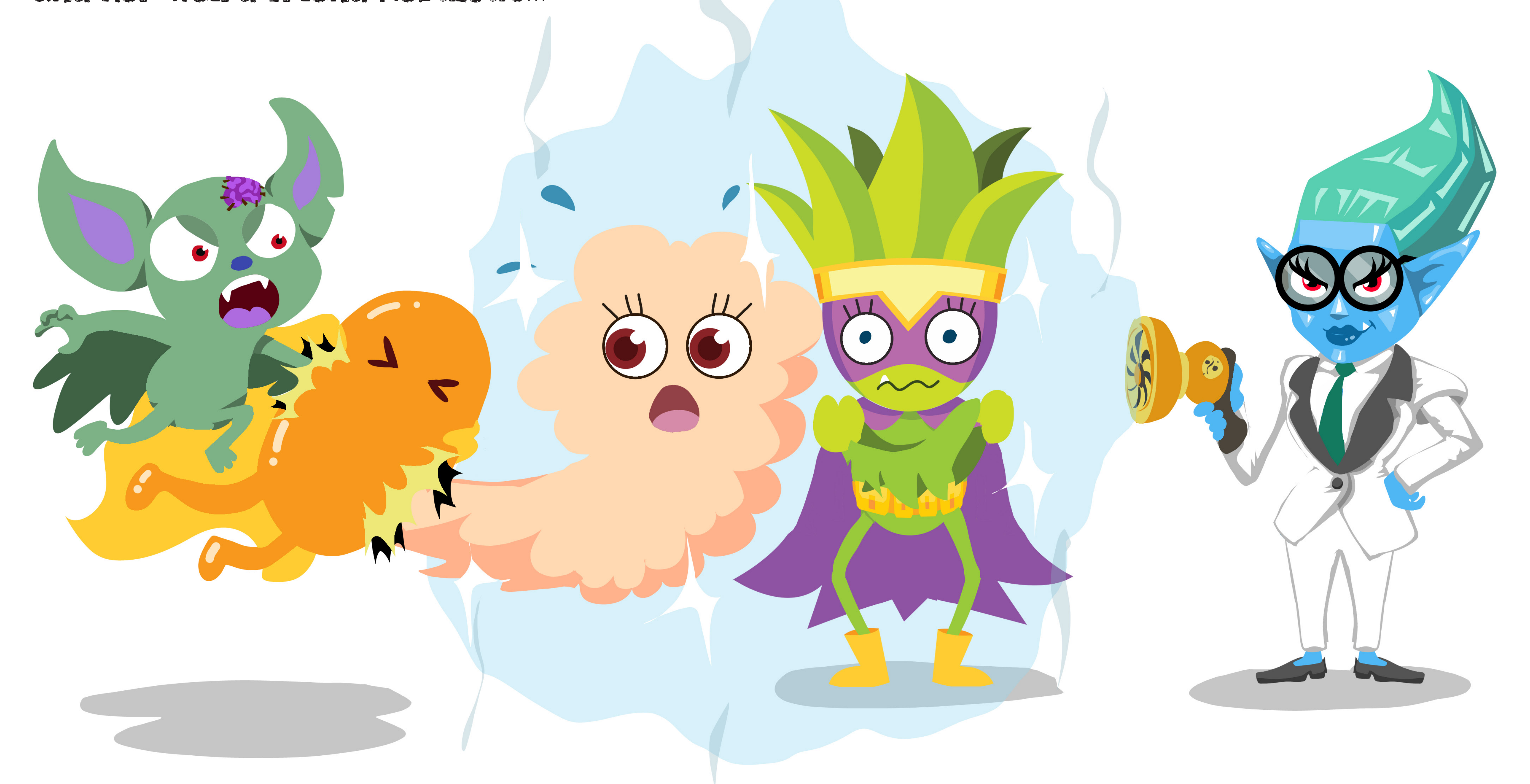
I'll get ready with a little something that I invented to put them on ice."